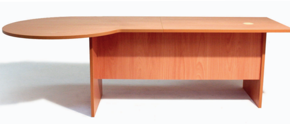
RH P END shown

Approved Supplier SCCB Contract No. 1006 20/10/2009 - 8/02/2013