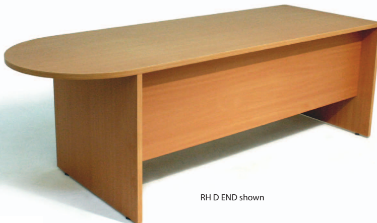
RH D END shown

Approved Supplier SCCB Contract No. 1006 20/10/2009 - 8/02/2013