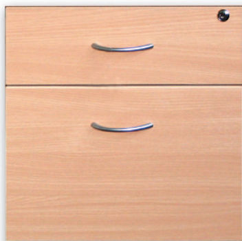
shown with lock and bow handles

Approved Supplier SCCB Contract No. 1006 20/10/2009 - 8/02/2013