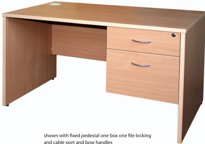
shown with fixed pedestal one box one file locking and cable port and bow handles